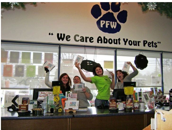
Staff from Pet Food Warehouse showing off the Coupon Book at their Williston Road location

The 2011 book will be publicly available for purchase for $10 each and will offer over $2,300 in savings. Books are distributed by local retailers, restaurants and community organizations throughout Chittenden, Addison and Washington counties. 5,000 copies will be printed in September and coupons offered in the book are redeemable over the course of the full year (until September 2012). This year, VBSR and Local First Vermont members receive a discounted rate for advertising, marketing and offering coupons.